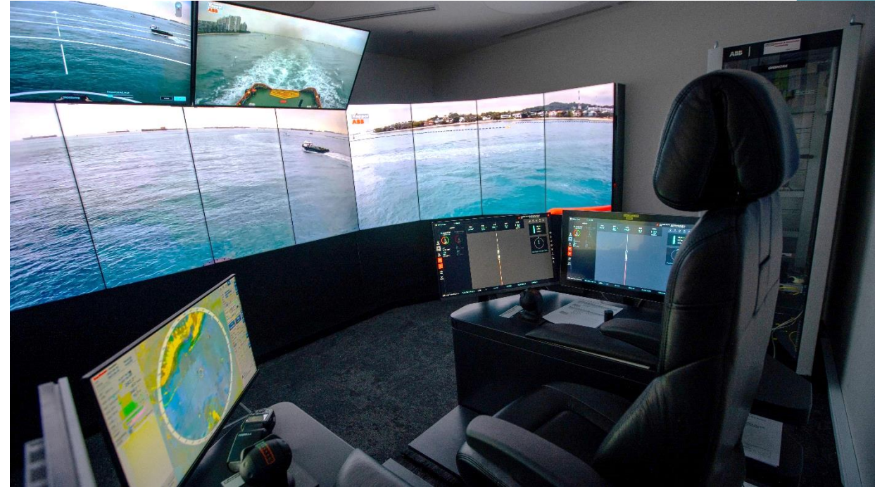
Set-up of shore command centre