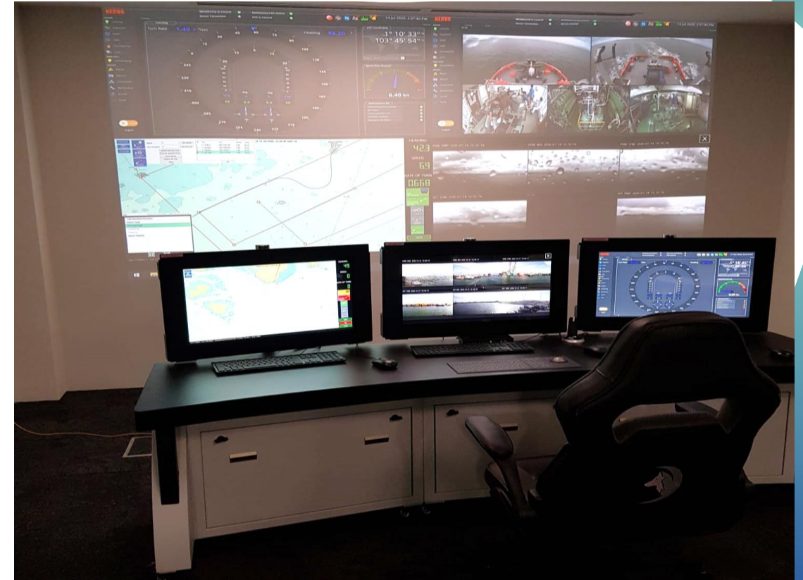
Set-up of shore command centre